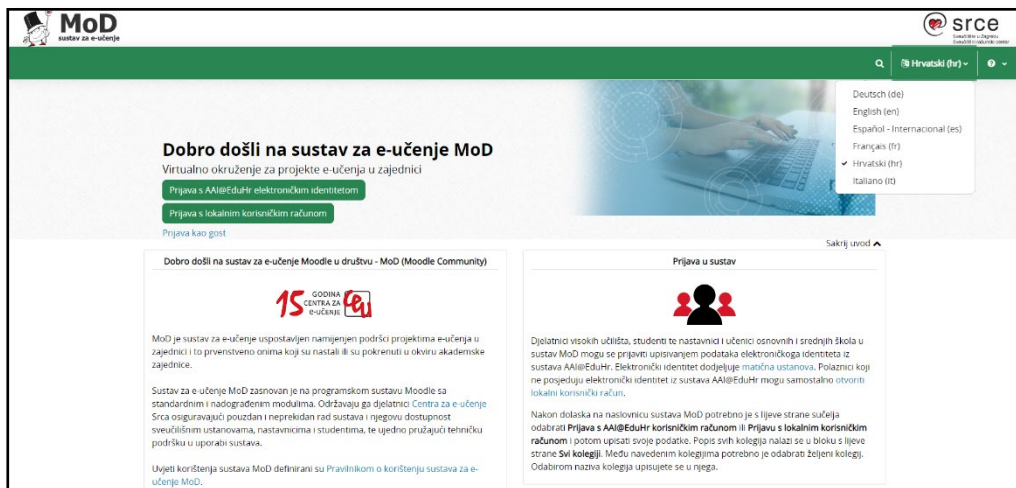
Caption 1: E-learning platform MoD

(To change the language of the interface, you need to select the drop-down menu with list of languages on the menu bar.)