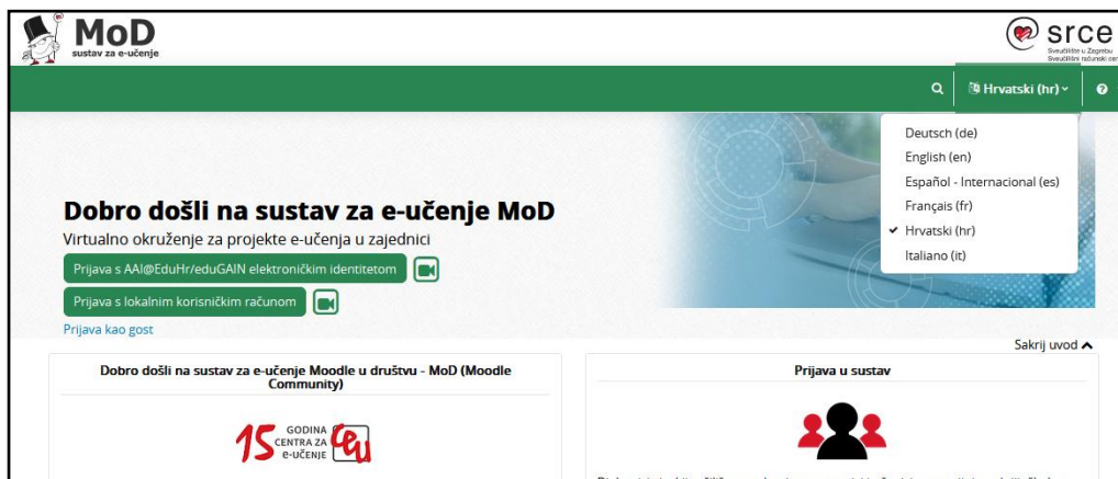
Caption 1: E-learning platform MoD

(To change the language of the interface, you need to select the drop-down menu with the list of languages on the menu bar.)