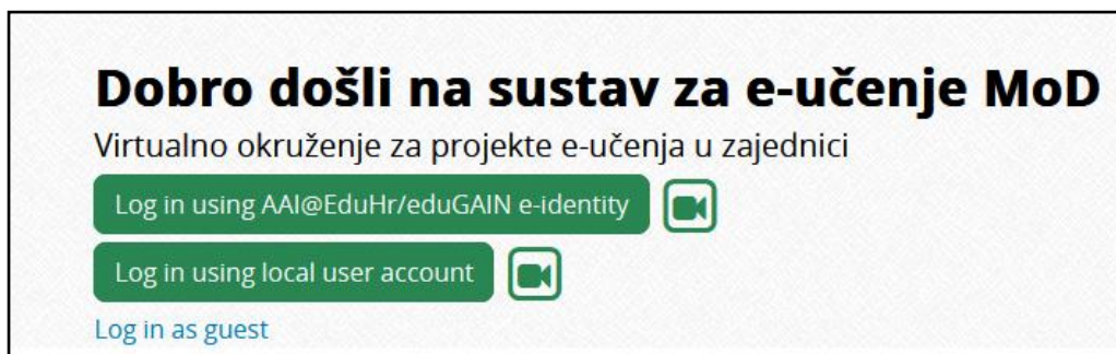
Caption 2: Log in using local user account button

Users who log in to the Mod for the first time using a local account should create it first. To create a local user account, select the Log in using local user account button and then the Create new account button in the Is this your first time here? block.