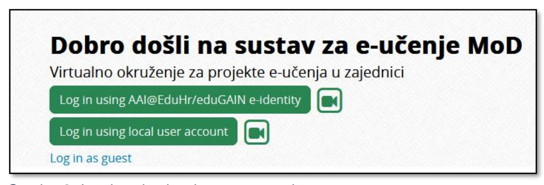
Caption 2: Log in using local user account button

Users who log in to the Mod for the first time using a local account should create it first. To create a local user account, select the Log in using local user account button and then the Create new account button in the Is this your first time here? block.