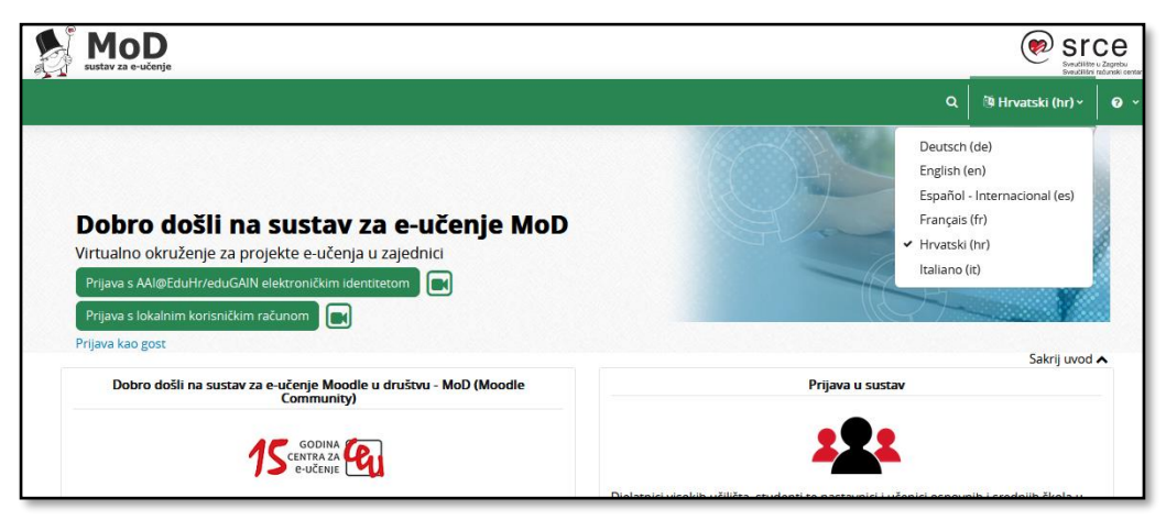
Caption 1: E-learning platform MoD

(To change the language of the interface, you need to select the drop-down menu with the list of languages on the menu bar.)